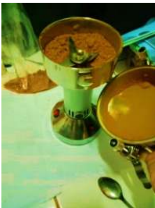
Powder Grinding Process of Turmeric and Curcuma

The service team provided all the tools and materials used by farmer partners. Training activities can be seen in Figure 4. The next step is monitoring and assisting. The development of chickens given turmeric and ginger continue to be monitored at this step. Turmeric and curcuma were safe for livestock to consume every day if the dose is correct and did not exceed the daily dose threshold. Turmeric and